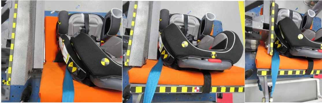
Figure 3. Seat belt position: door position before intrusion (left), door position when armrest is touching CRS (middle) and door position at maximum intrusion – No foam on door (right).