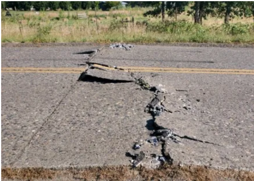
Tiffany and Andrew Prather said they felt a tremor when the road buckled outside their home in Dayton on June 27, 2021.

Each day of that three day stretch broke the all-time high temperature record in Portland, which was previously 107. June 26 saw the mercury hit 108, then it hit 112 on June 27, then a staggering 116 on June 28.