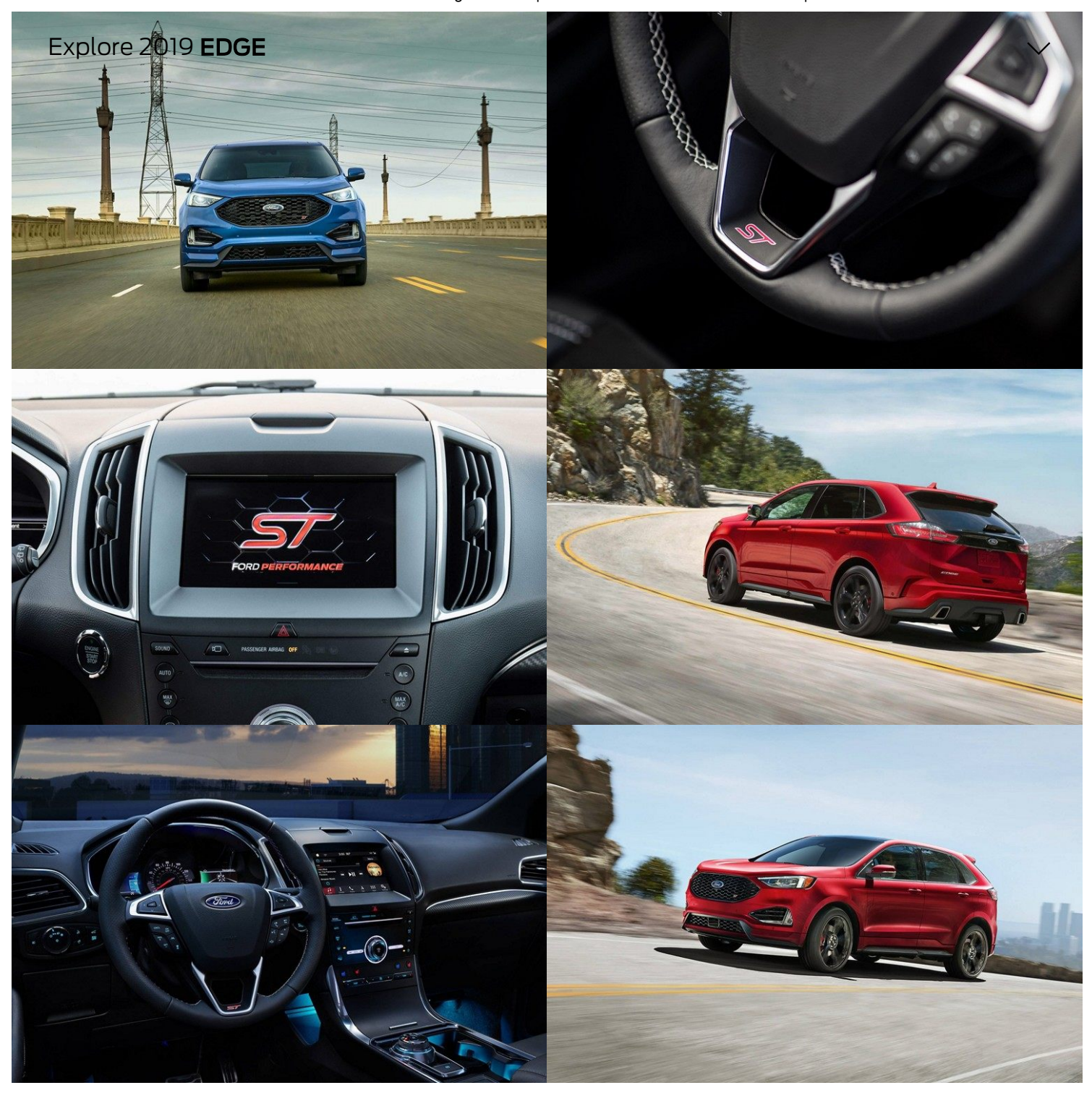
View More ∨