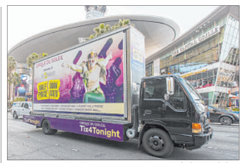
A truck carries a mobile billboard along the Strip on Saturday.