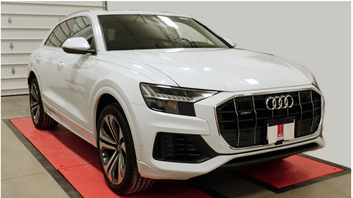
2019 Audi Q8