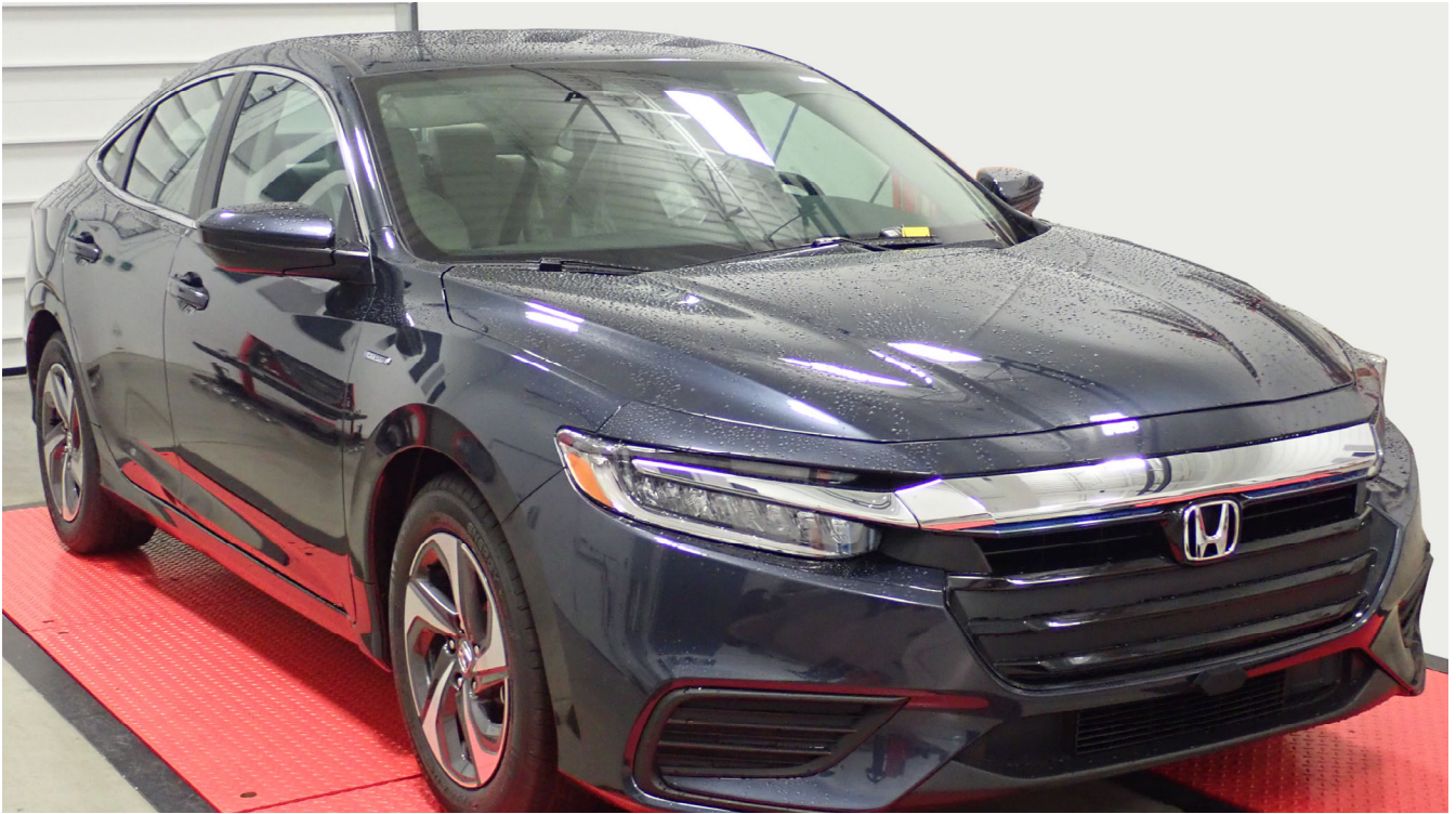
2019 Honda insight