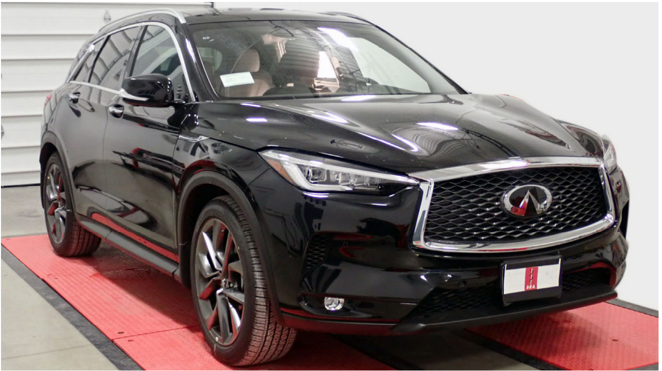
2019 Infiniti QX50 AWD