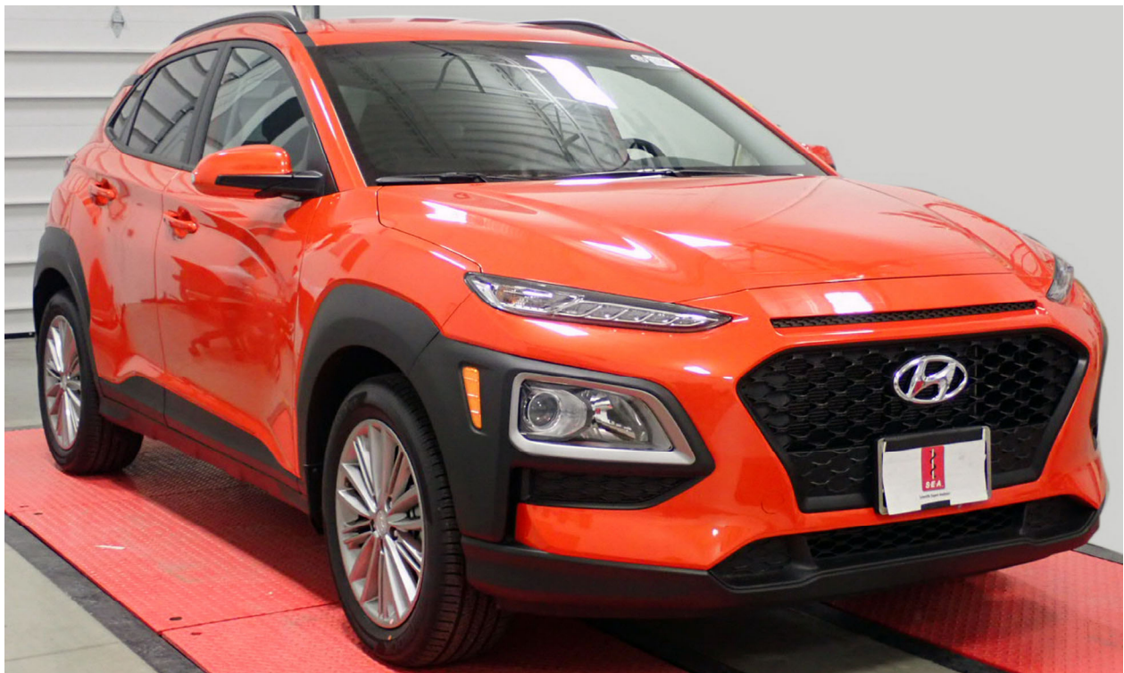
2019 Hyundai Kona FWD