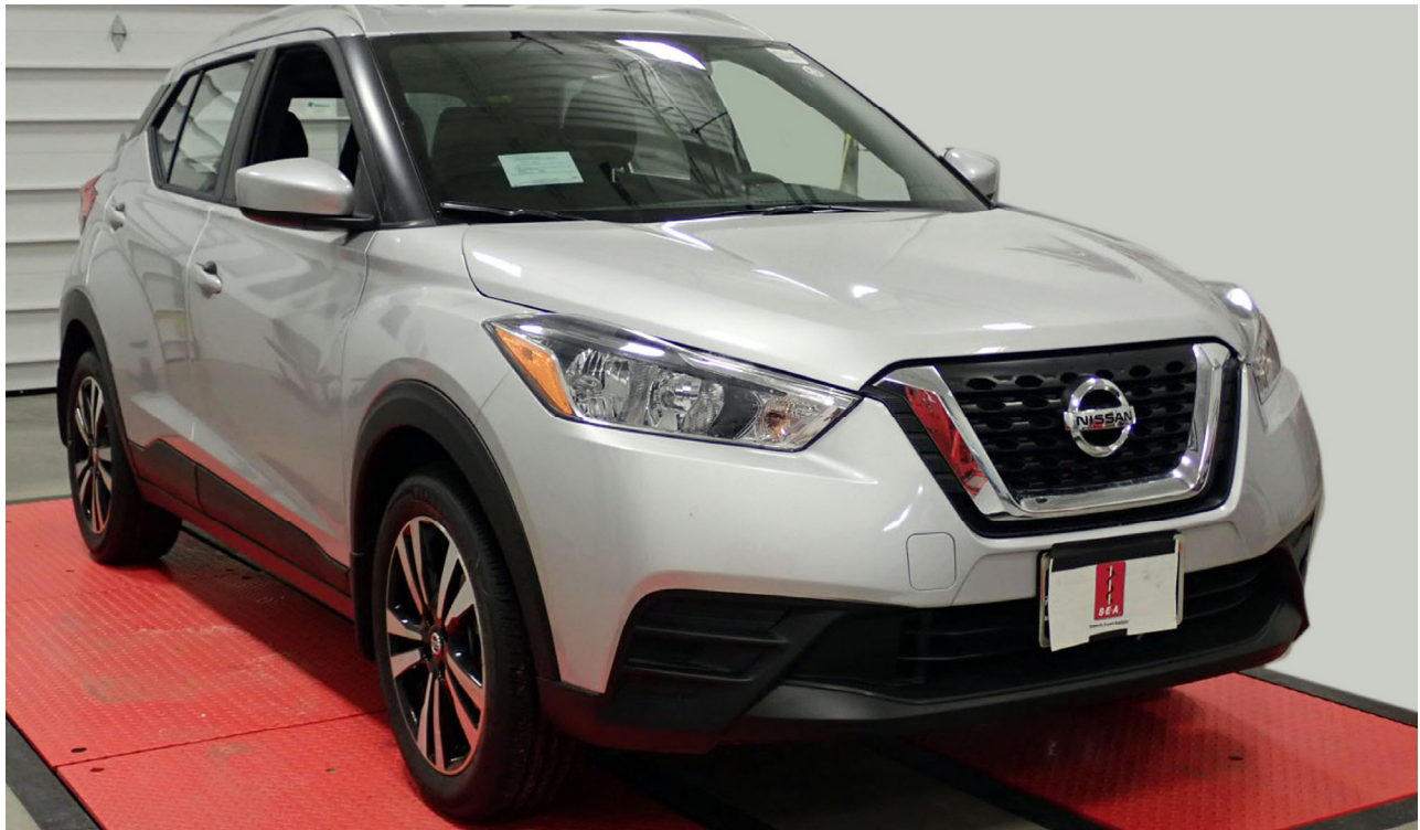
2019 Nissan Kicks FWD