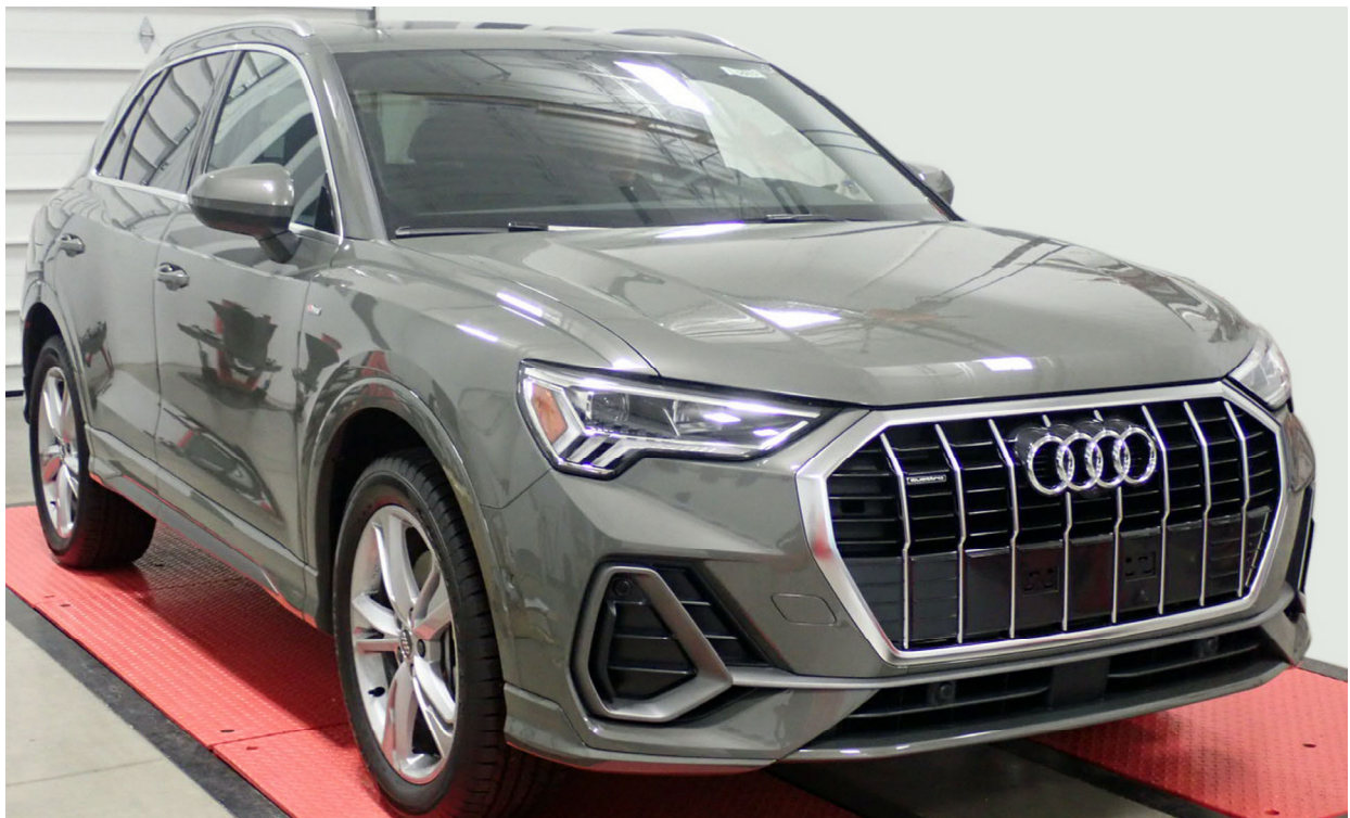
2019 Audi Q3 AWD