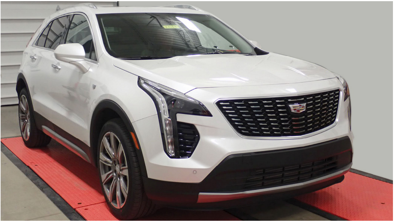
2019 Cadillac XT4 FWD