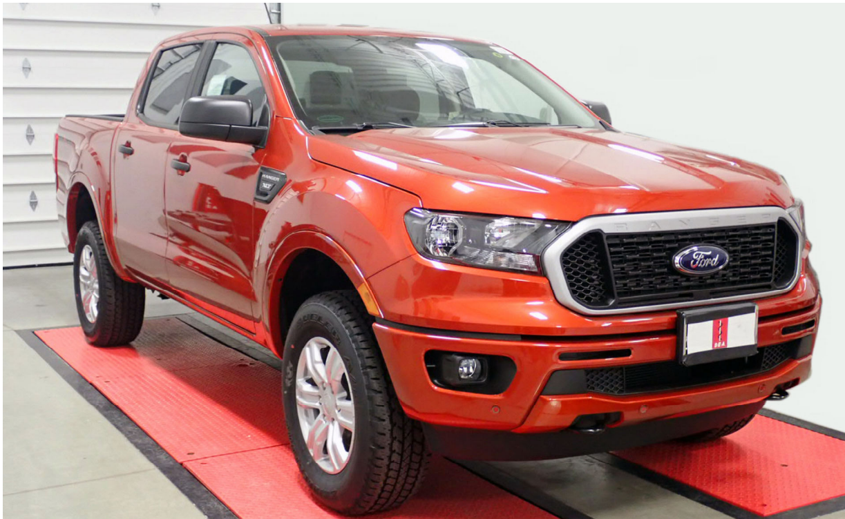
2019 Ford Ranger SuperCrew 4X4