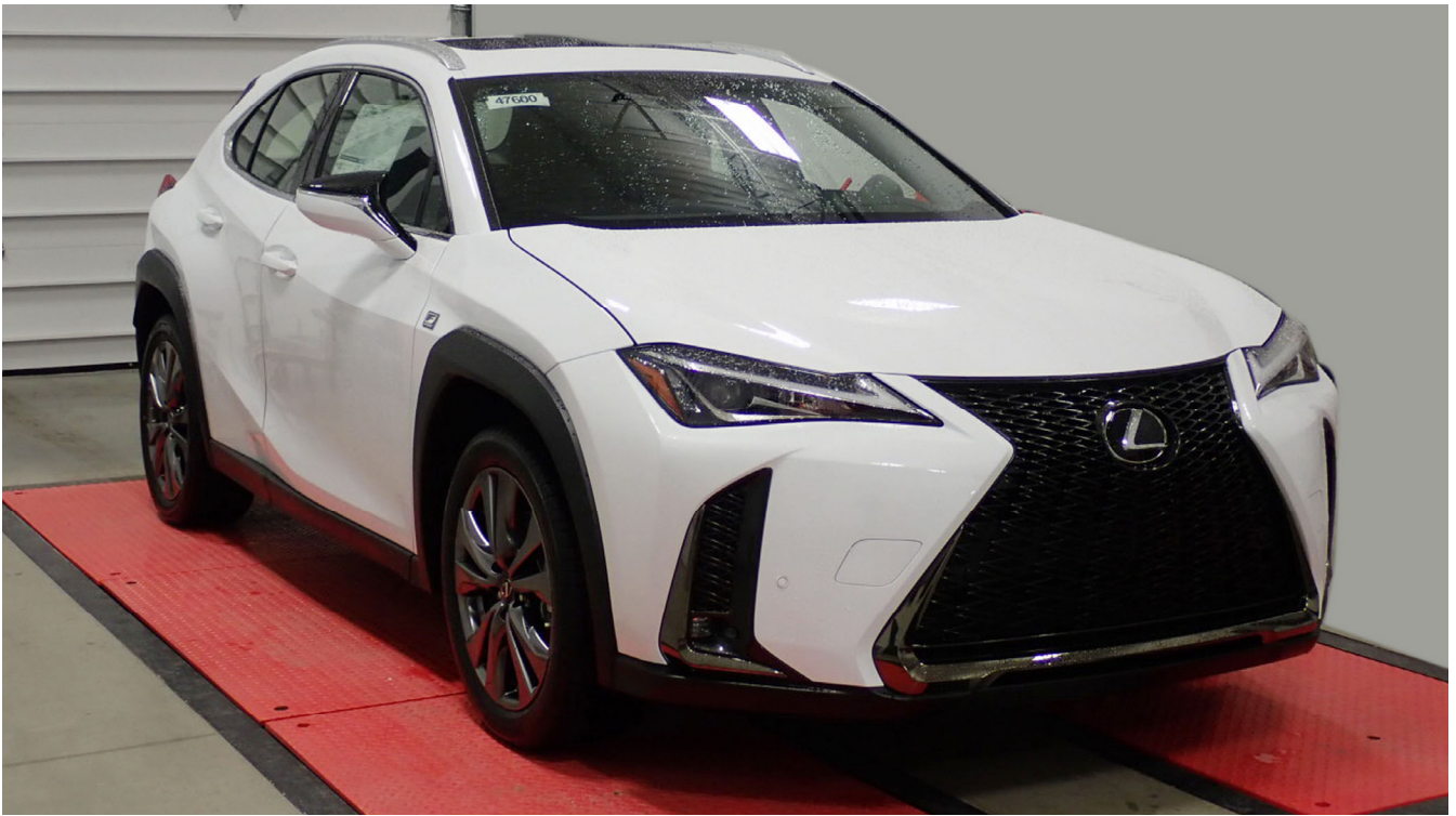
2019 Lexus UX200 FWD