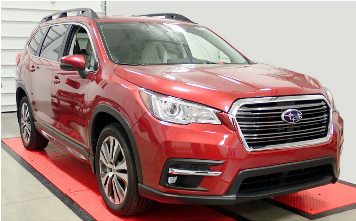
2019 Subaru Ascent