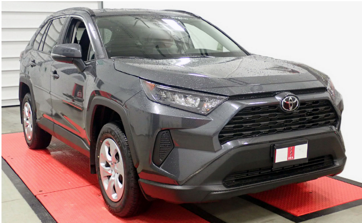
2019 Toyota RAV4 AWD