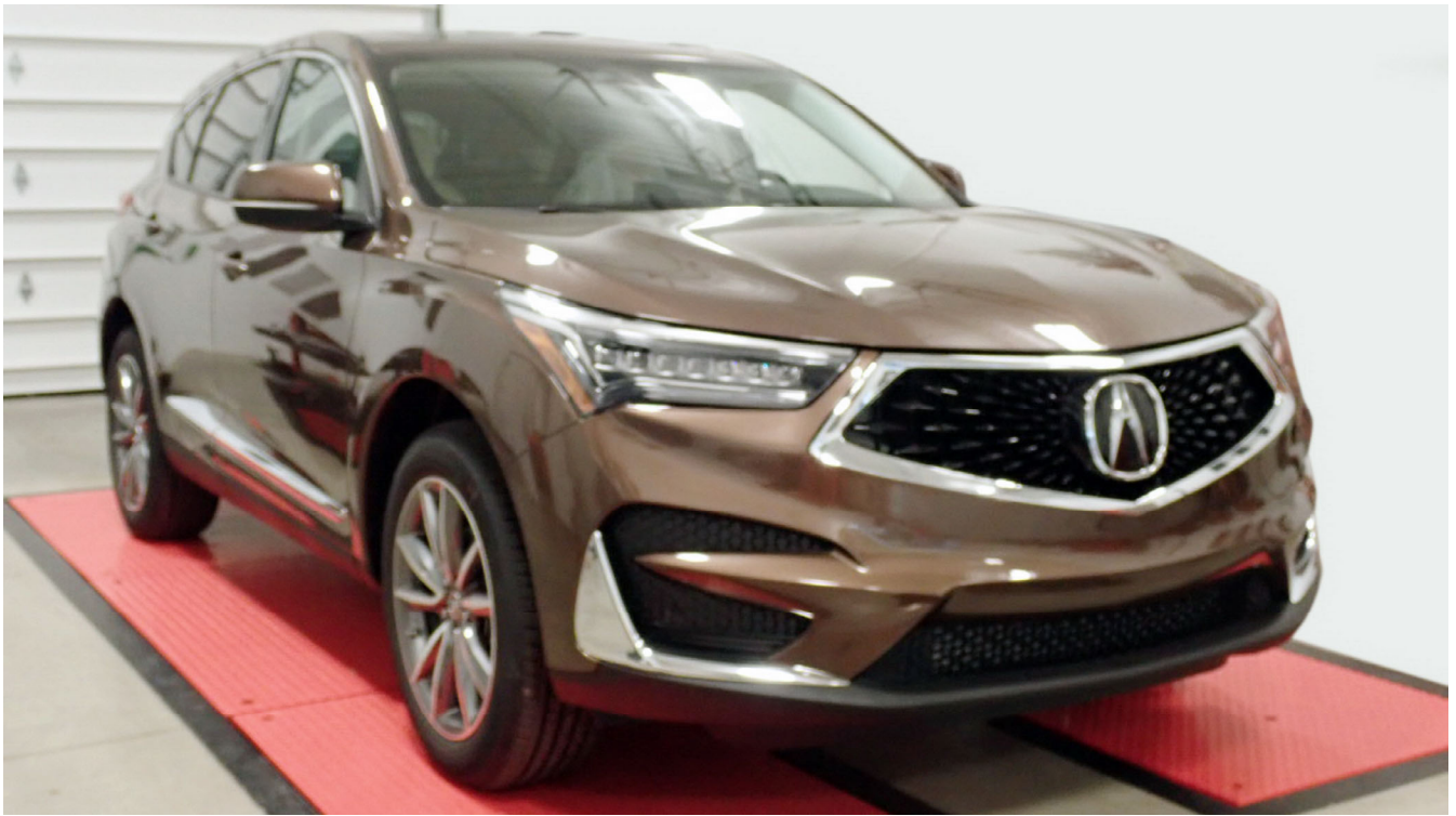
2019 Acura RDX AWD