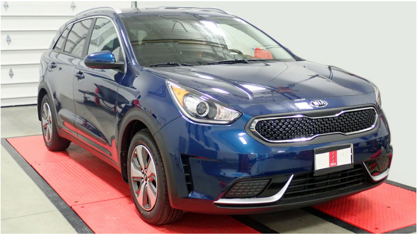
2019 Kia Niro Hybrid