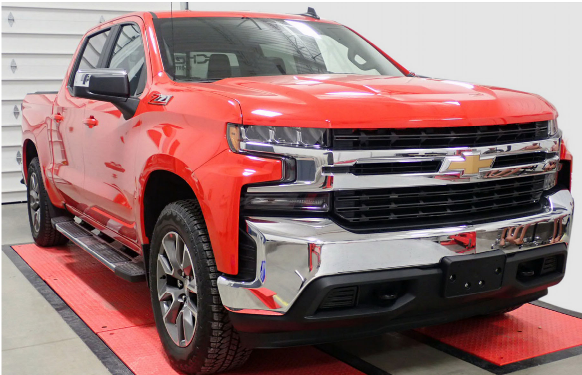
2019 Chevrolet Silverado Crew 4X4