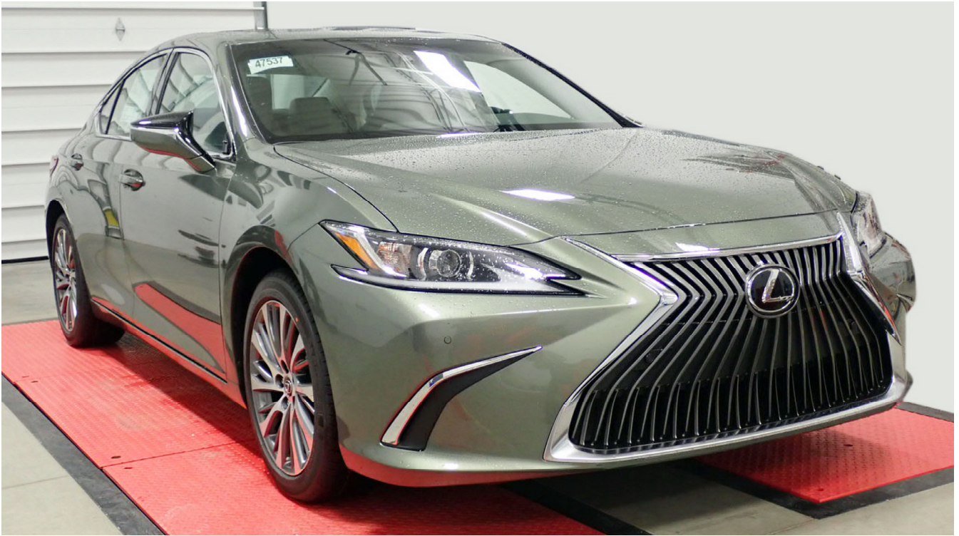
2019 Lexus ES350 FWD