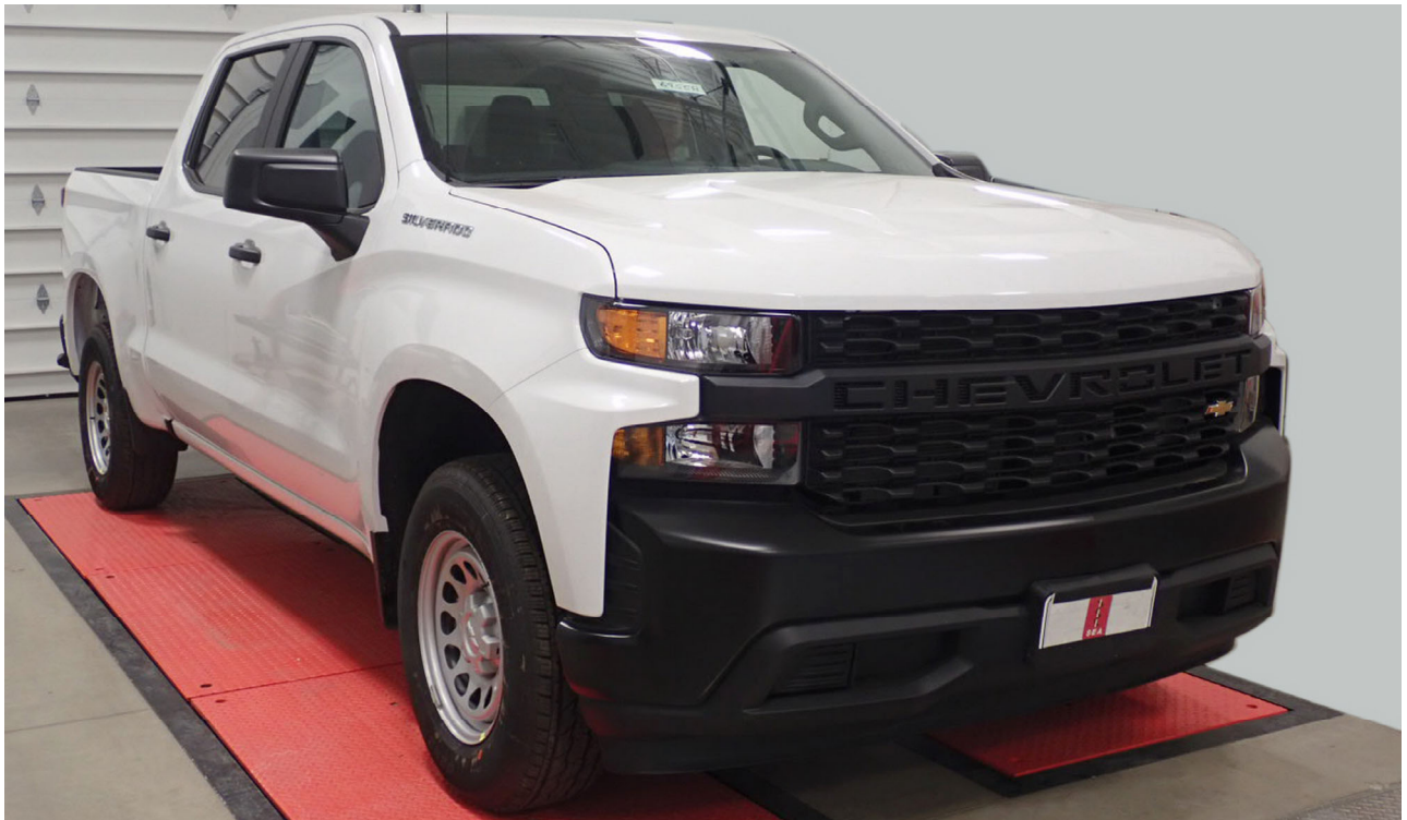
2019 Chevrolet Silverado Crew 4X2