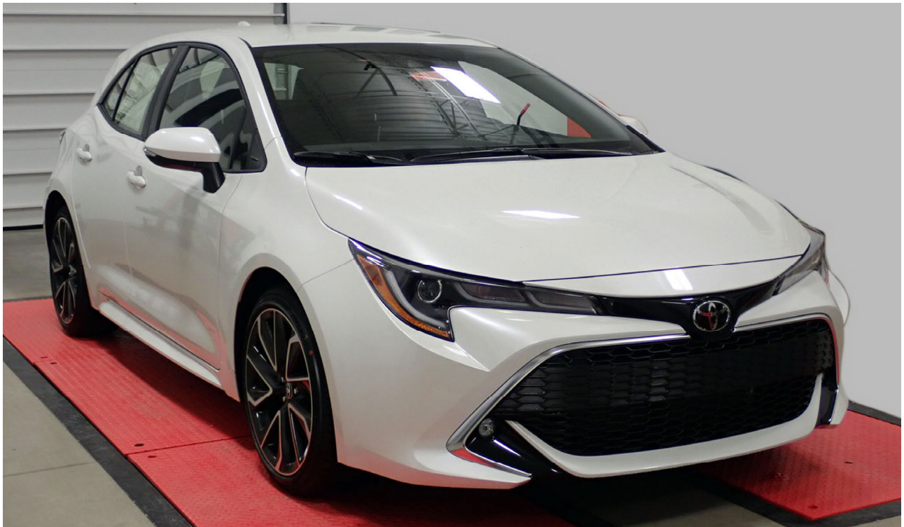
2019 Toyota Corolla