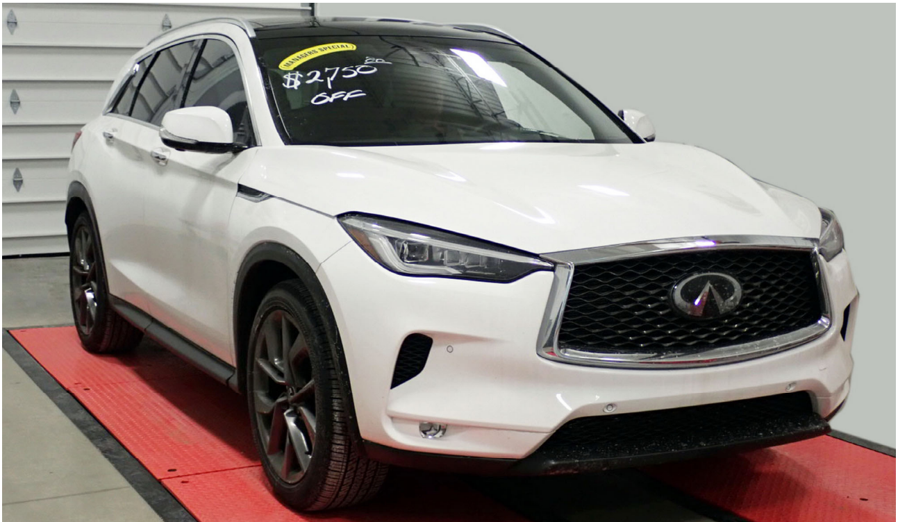
2019 Infiniti QX50 FWD