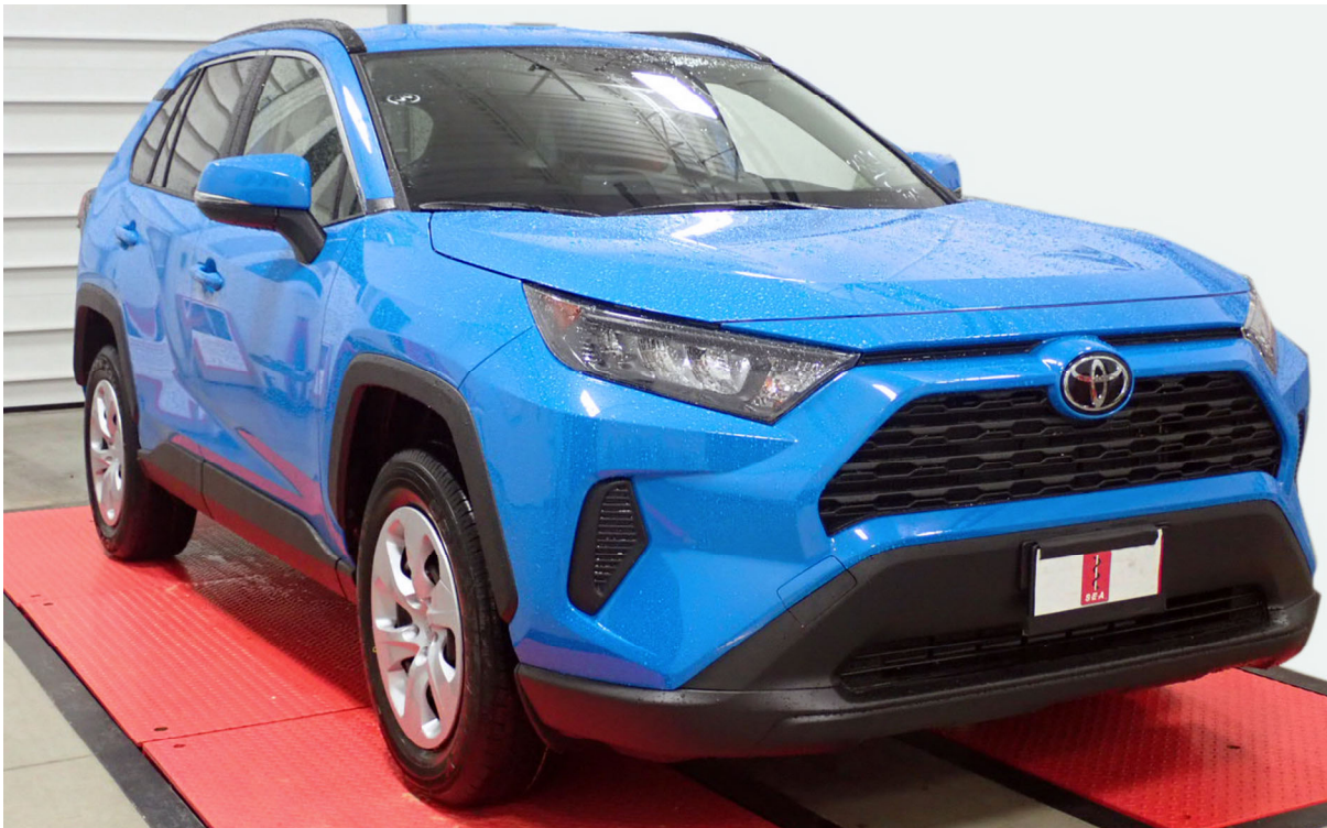
2019 Toyota RAV4 FWD