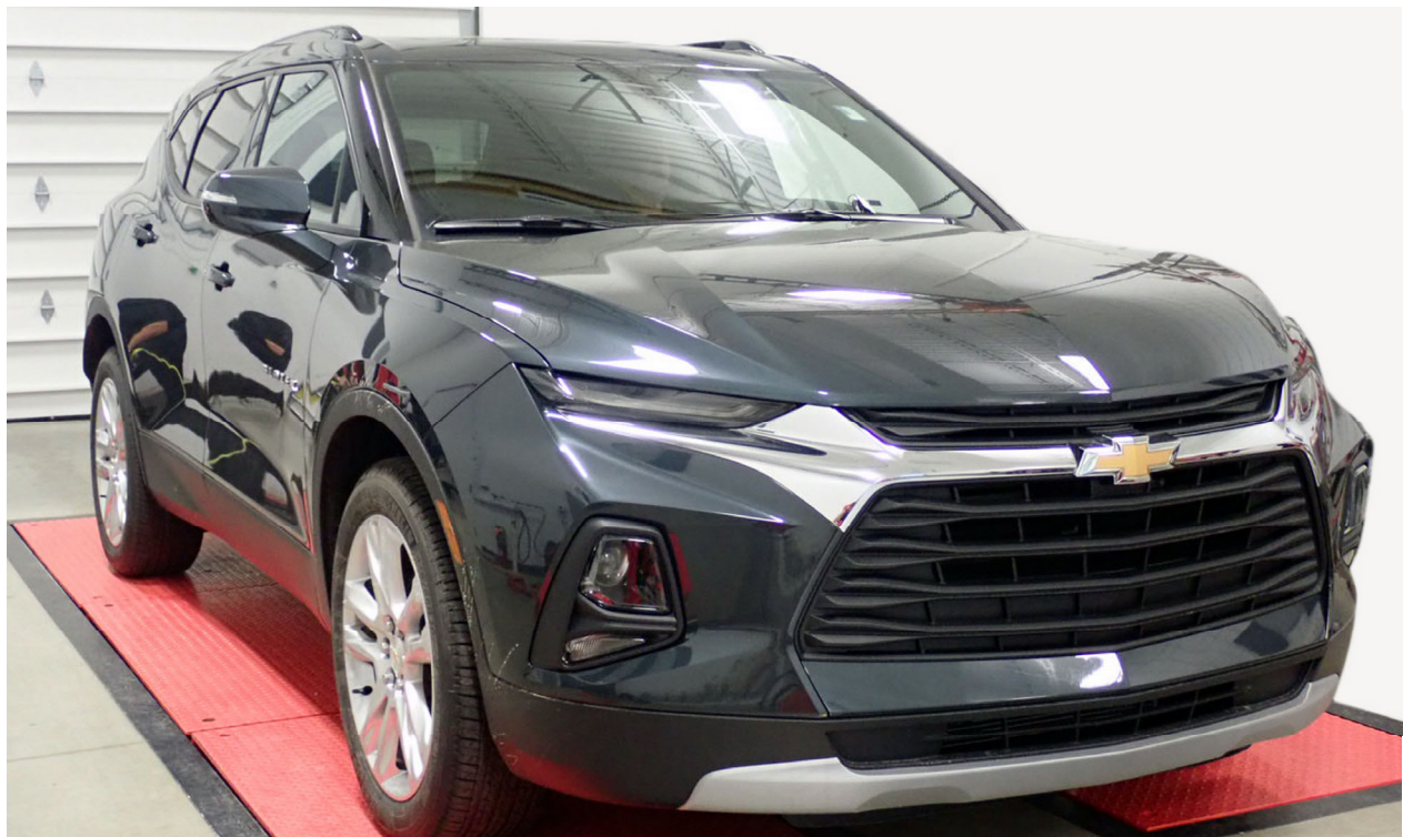
2019 Chevrolet Blazer FWD