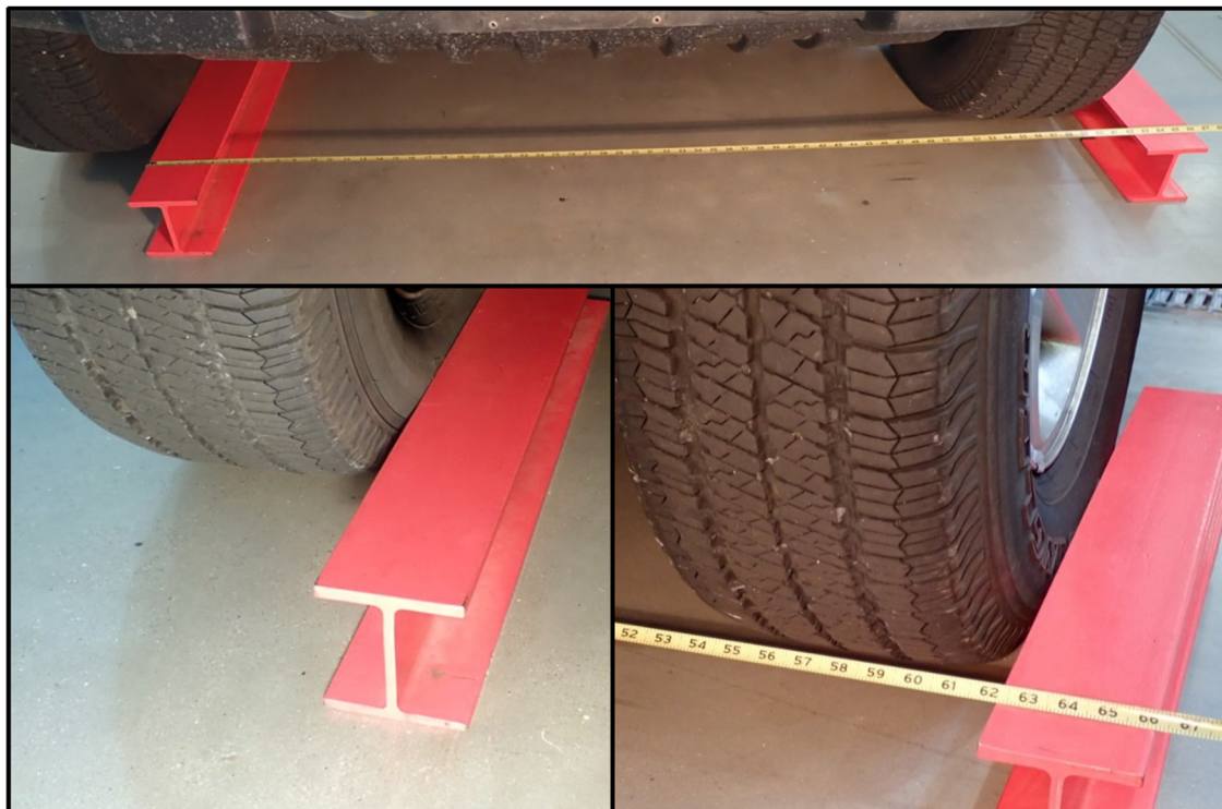
Figure 2: Measurements at S-E-A