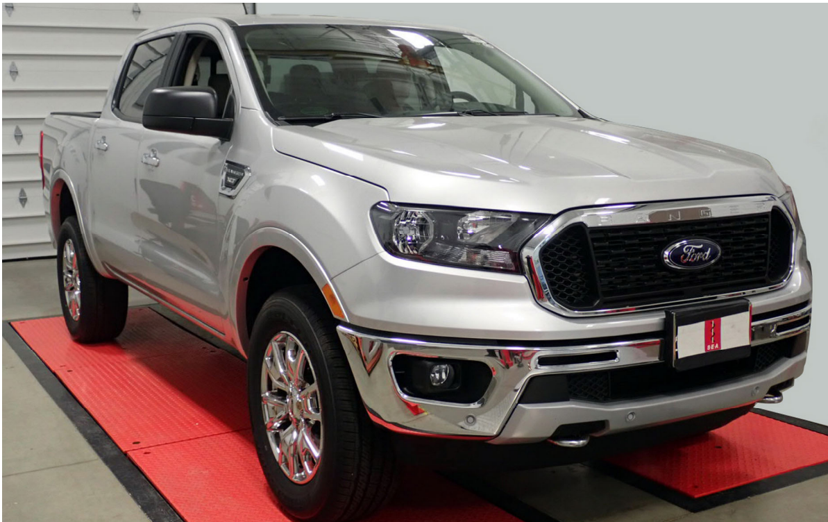
2019 Ford Ranger SuperCrew 4X2