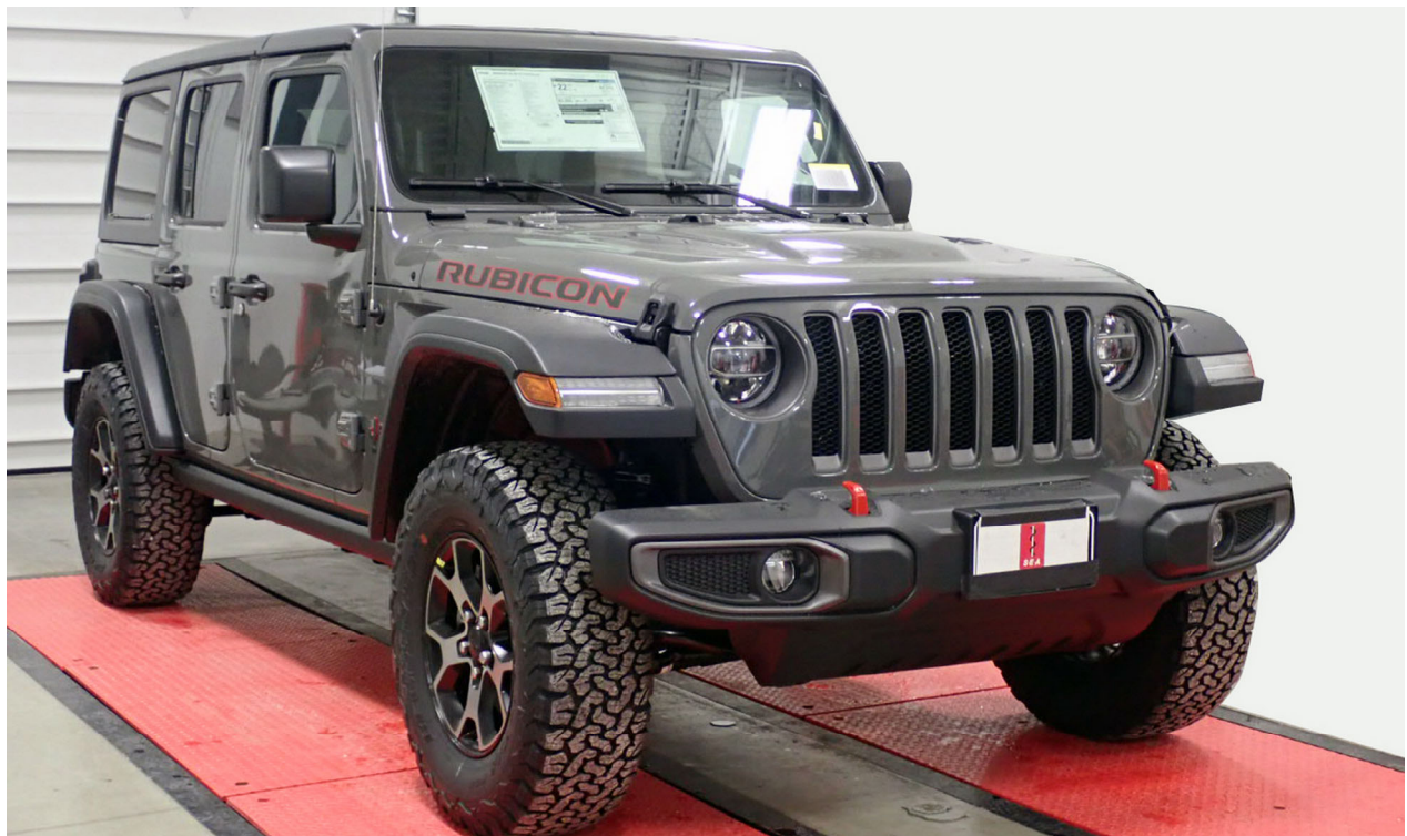
2019 Jeep Wrangler Unlimited 4X4