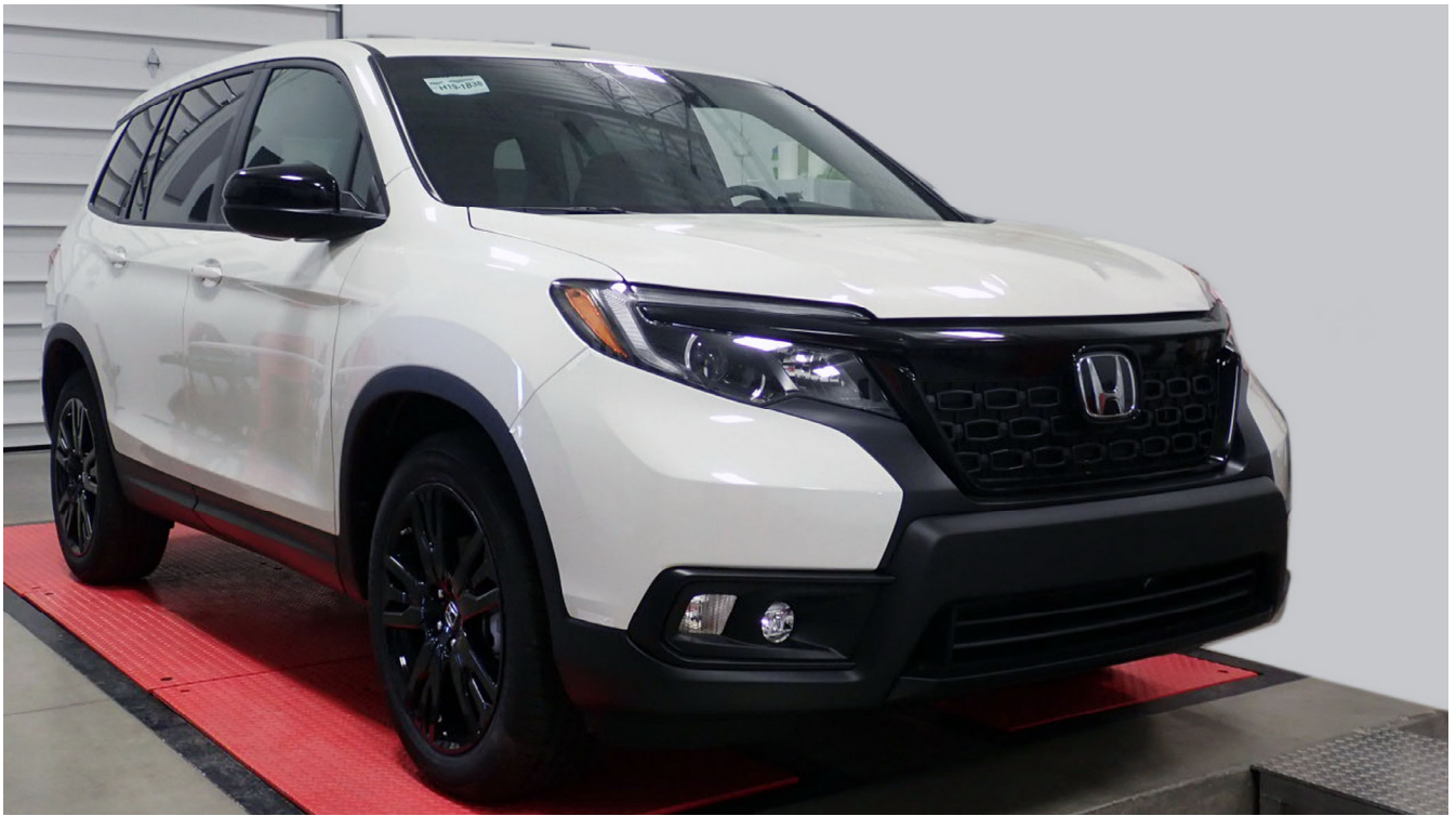
2019 Honda Passport FWD