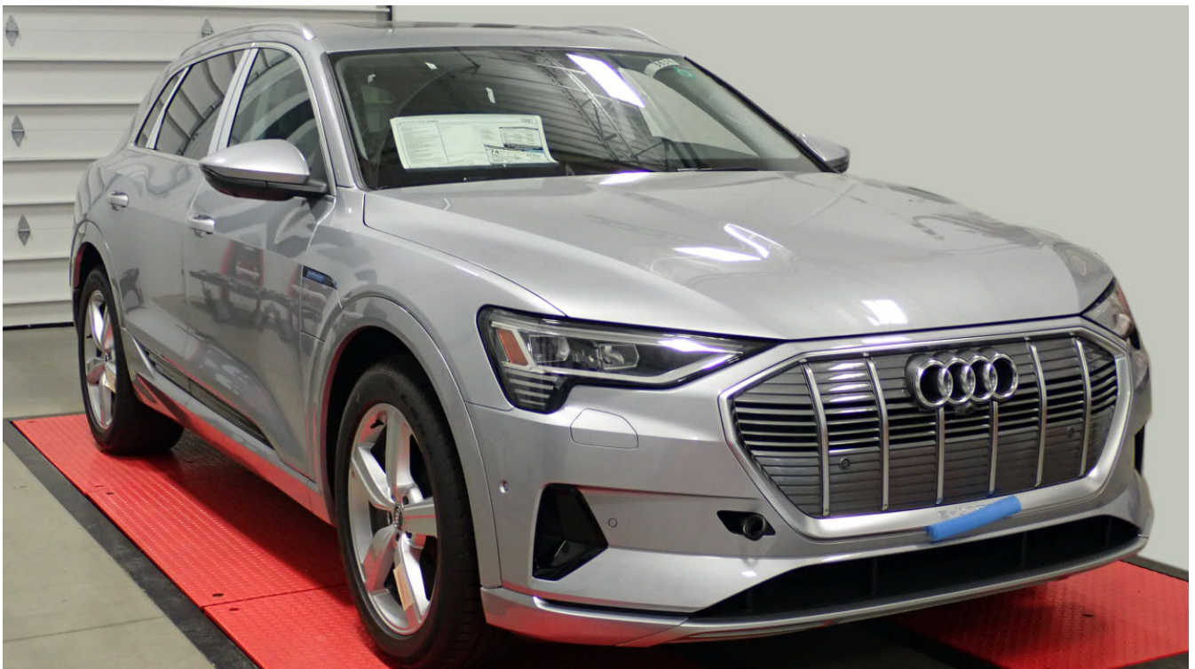
2019 Audi E-Tron