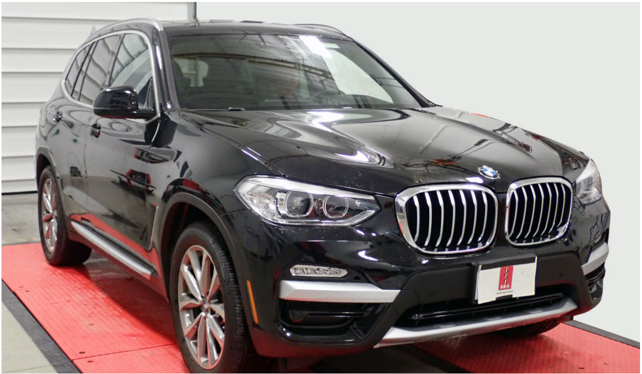
2019 BMW X3 AWD