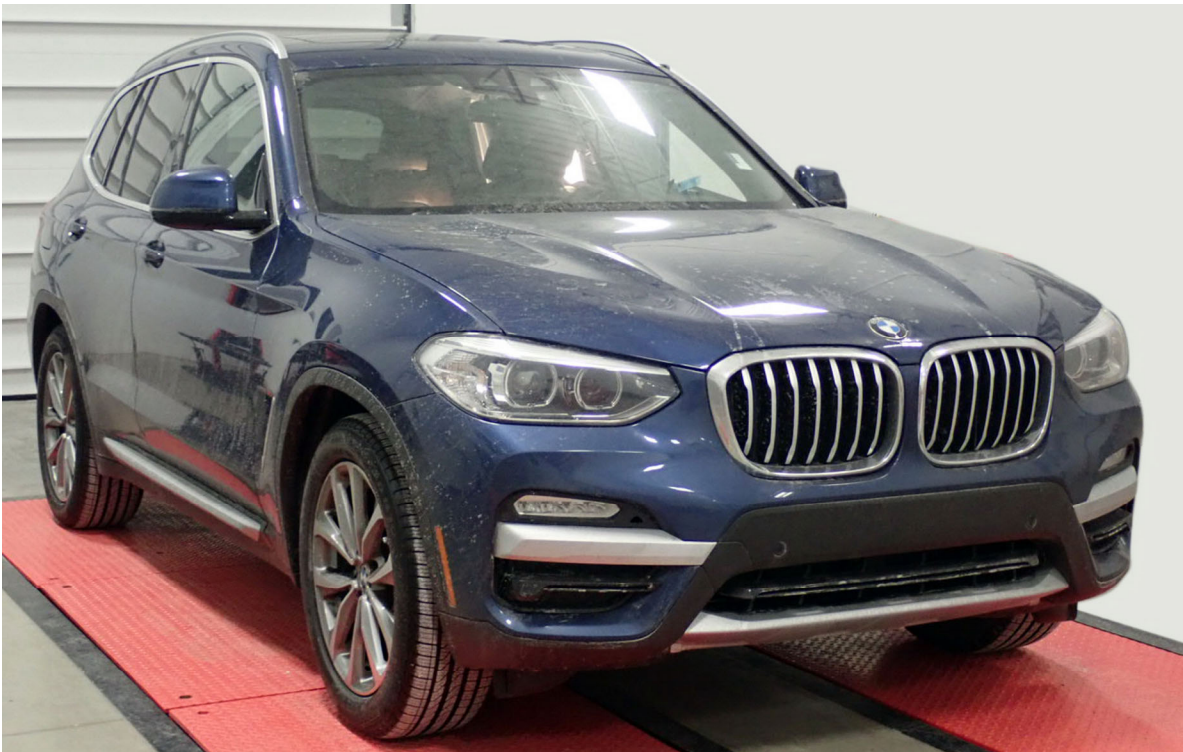
2019 BMW X3 RWD