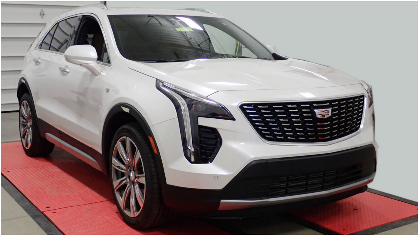
2019 Cadillac XT4 AWD