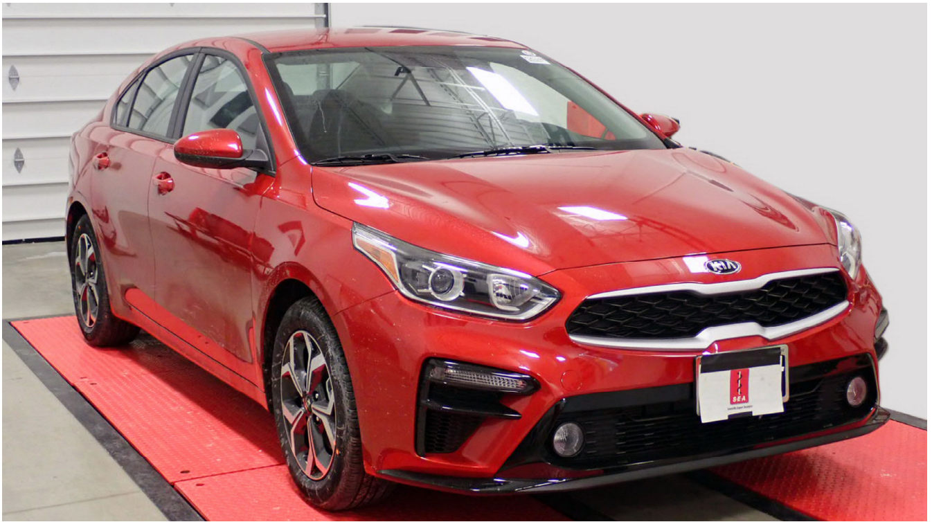
2019 Kia Forte