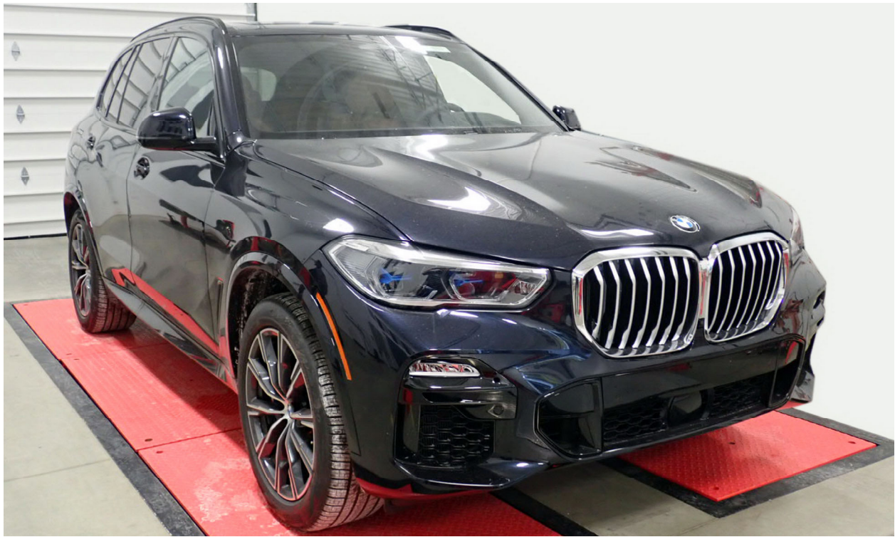
2019 BMW X5 AWD