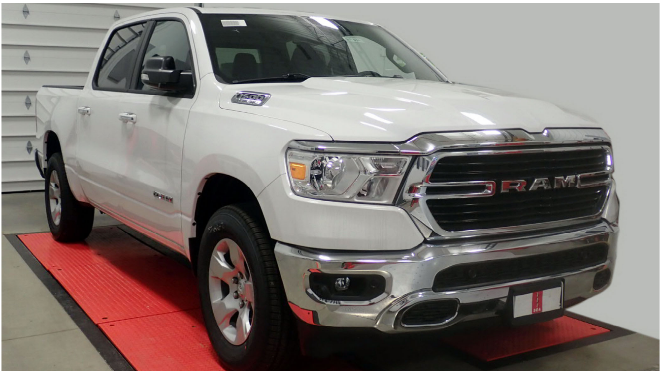
2019 Ram 1500 4X4 Crew Cab