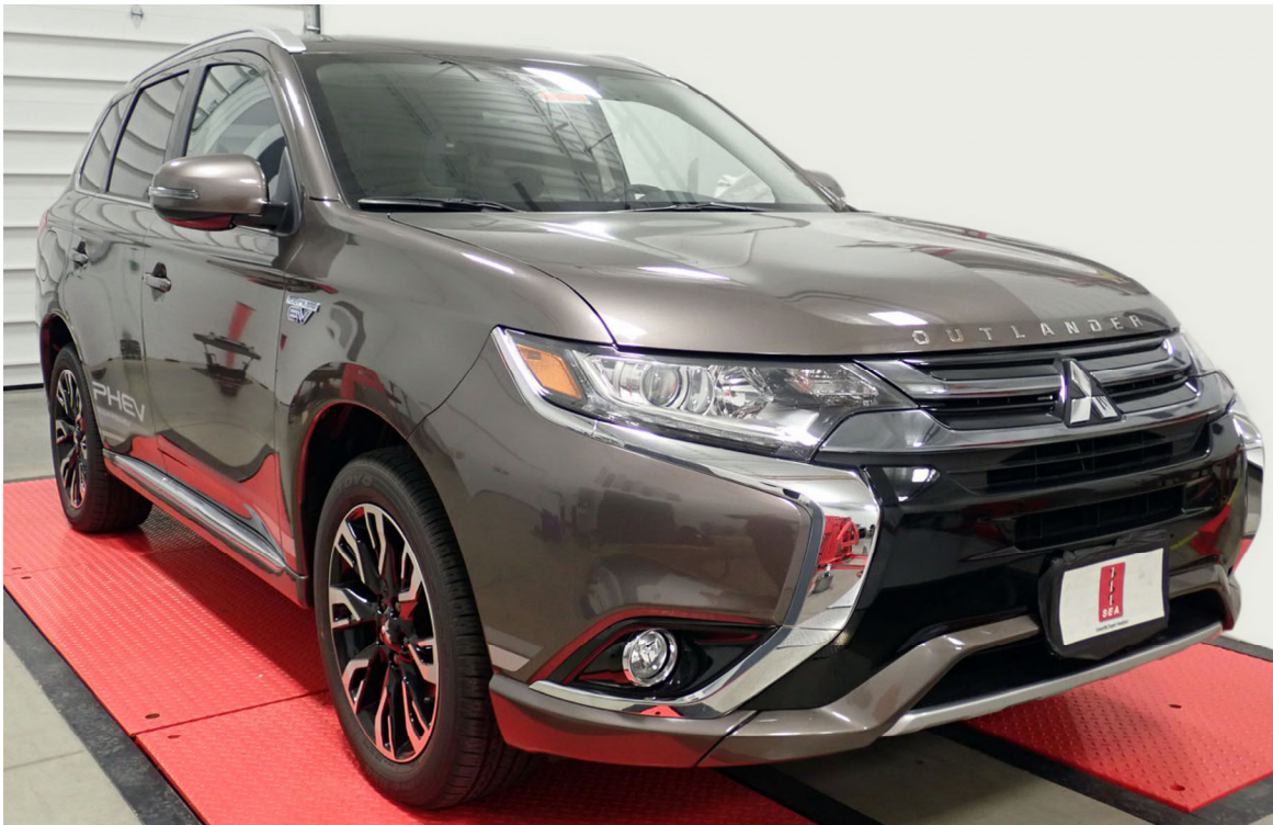
2018 Mitsubishi Outlander PHEV