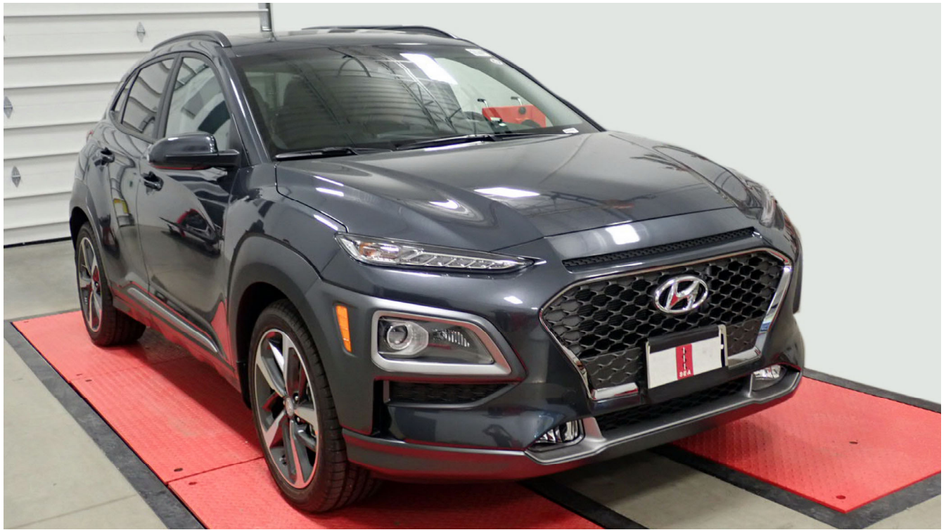
2019 Hyundai Kona AWD