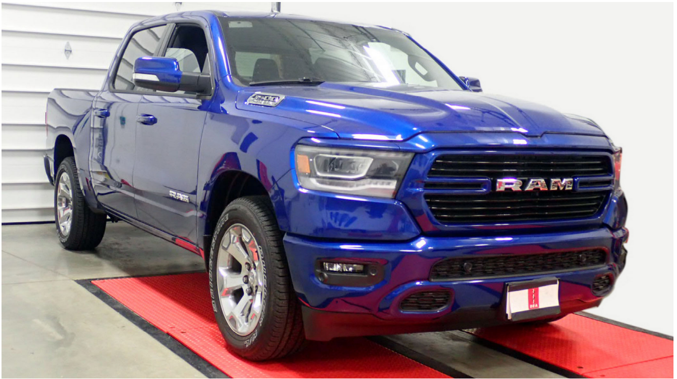
2019 Ram 1500 4X2 Crew Cab