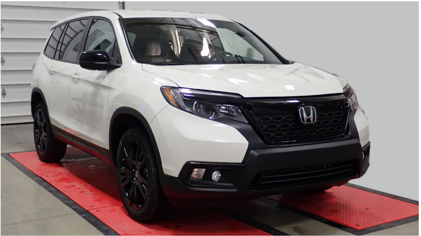
2019 Honda Passport AWD