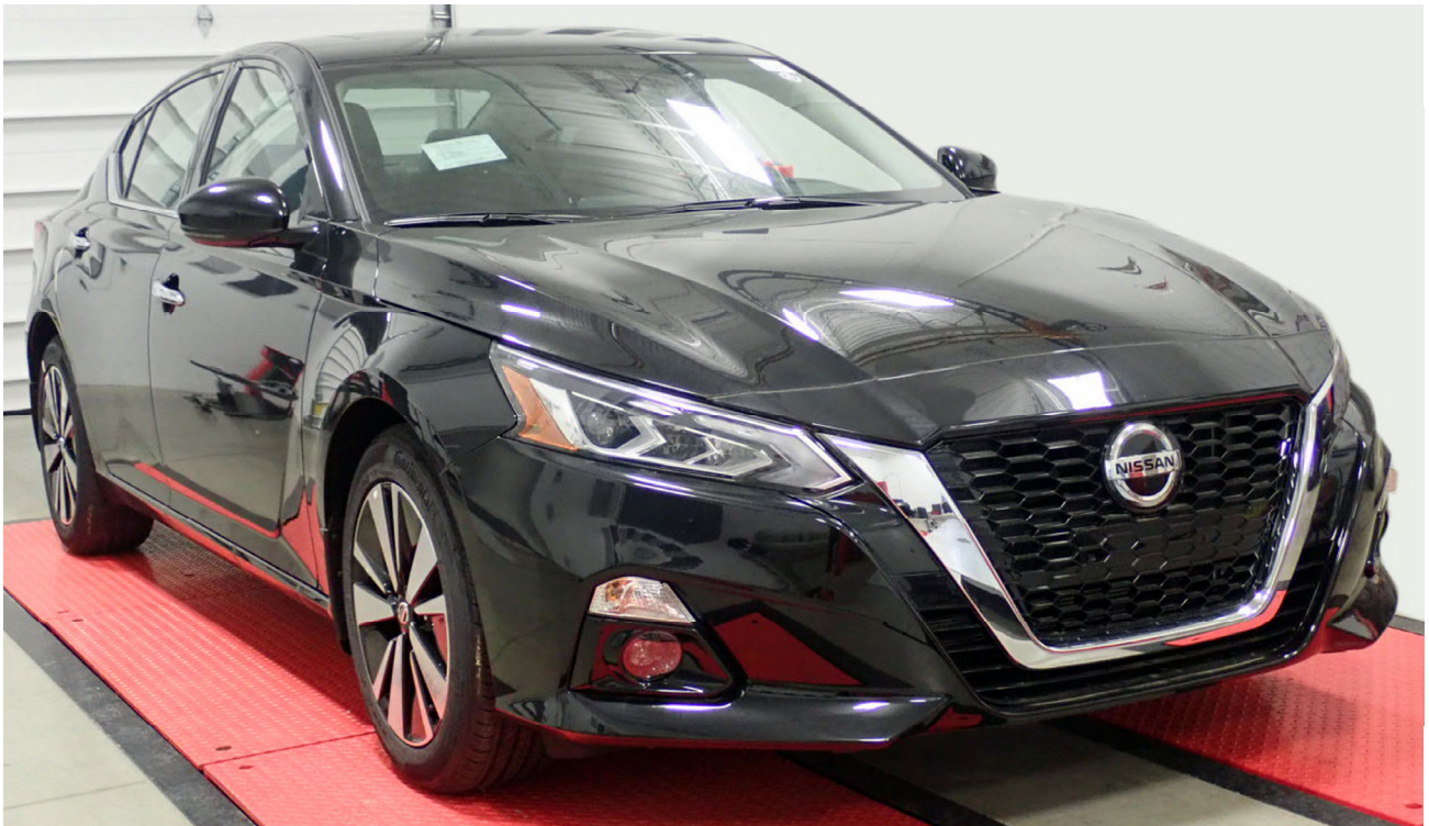
2019 Nissan Altima