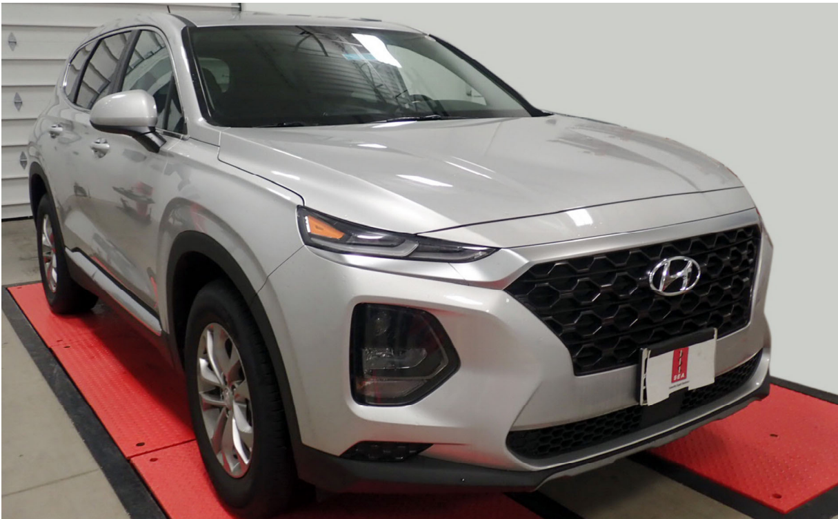
2019 Hyundai Santa Fe AWD