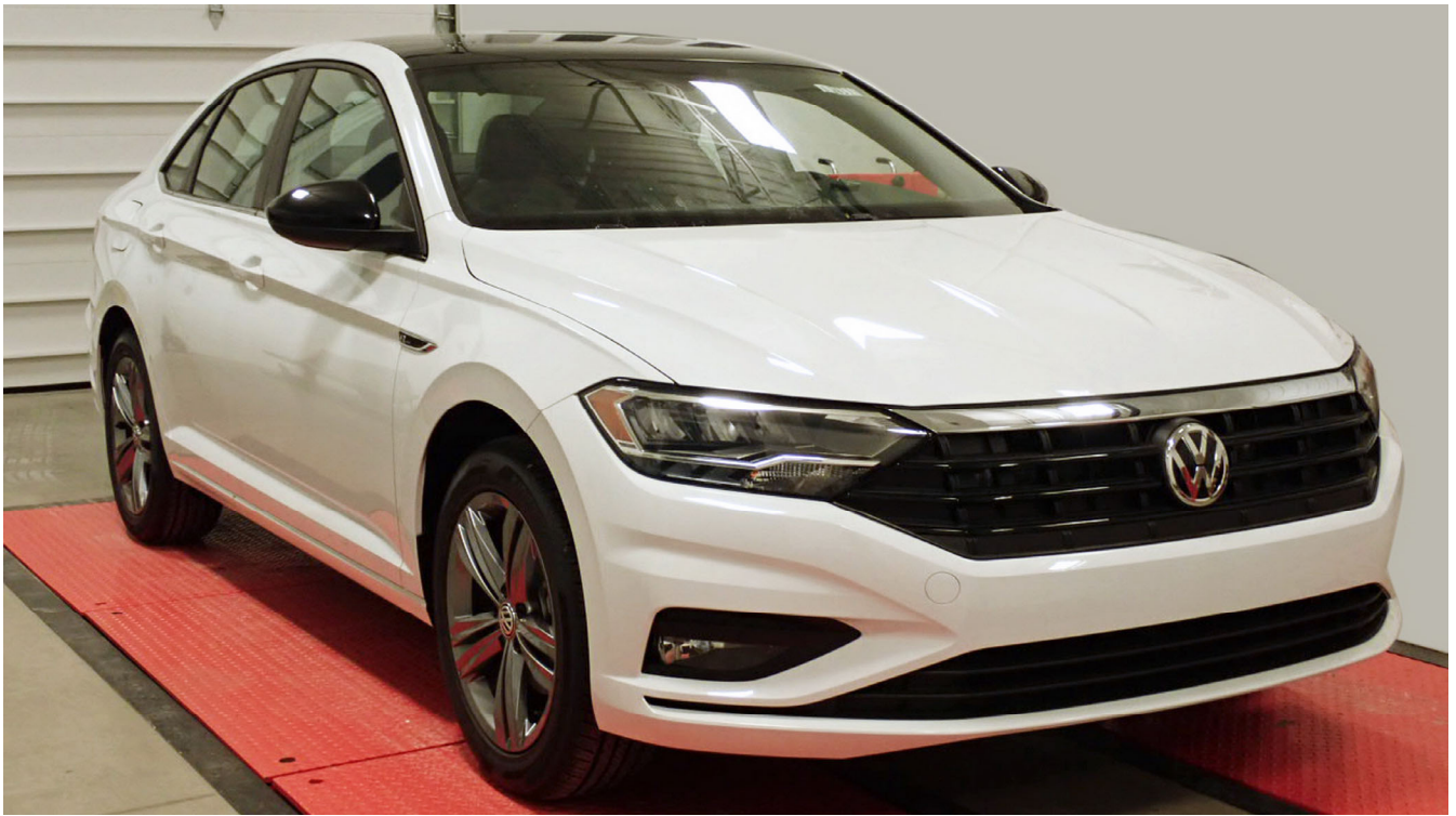
2019 Volkswagen Jetta