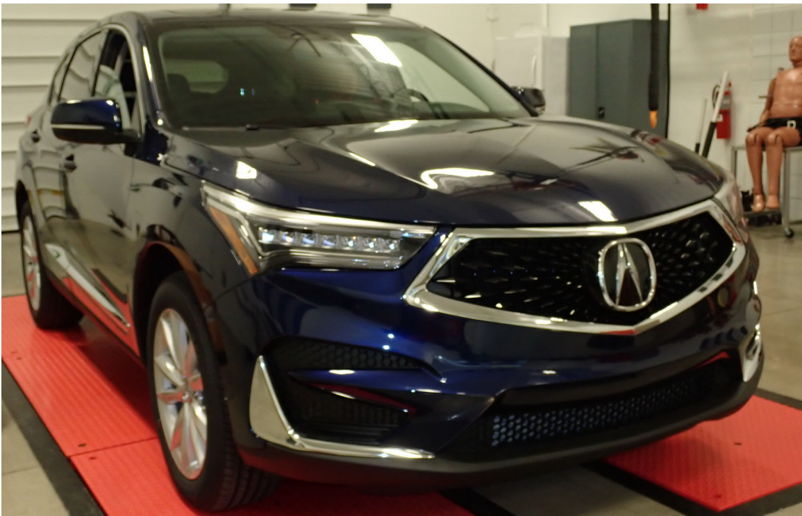
2019 Acura RDX FWD