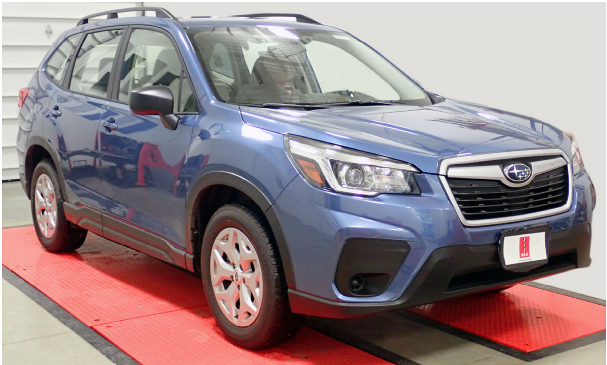
2019 Subaru Forester