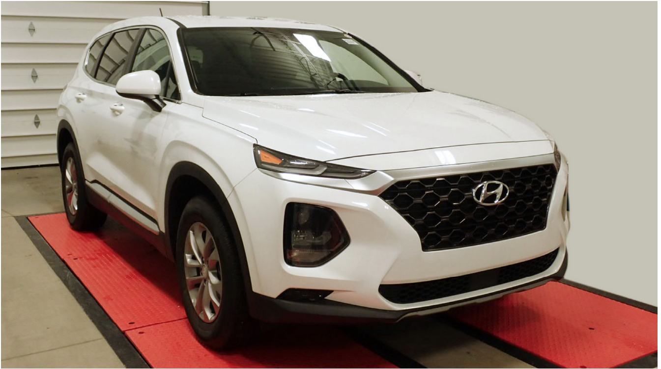
2019 Hyundai Santa Fe FWD